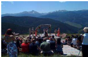
Vail Wedding Deck

The moment you say "I DO" is one of the most important times of your wedding day. Hire greatime dj to provide professional audio for your ceremony so all of your guests can properly hear the magic moment!